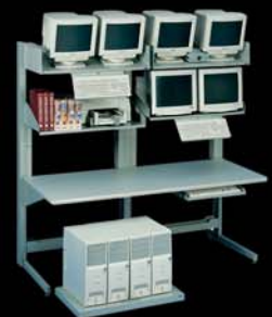
Technical Furniture Systems™