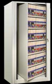
Ez2® Rotary Action File